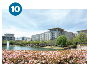
10 Legacy & Legacy West Plano

Incorporates Frisco's City Hall and public library along with shopping, apartment buildings, and office space.