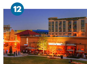
12 Watters Creek Allen

You'll remember it for the giant blue steel sculpture in the center of a roundabout. You'll visit for events like Kaboom Town and Oktoberfest.