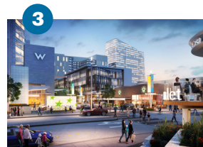
3 Victory Park Dallas

Pioneering walkable district in the heart of Uptown. Accessed by DART and the M-Line Trolley. Magnolia Theatre joins scene-packed dining and unique retail.