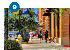
9 Frisco Square Frisco

Park free on the 35 blocks of brick-paved streets in Downtown Fort Worth. Features restored turn-of-the-century buildings and an expansive plaza.