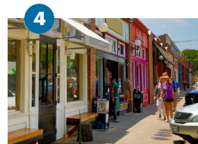
4 Bishop Arts Dallas

Anchored by the American Airlines Center with a crowd-gathering screen-filled plaza. High-rise living is upscale and service-oriented.