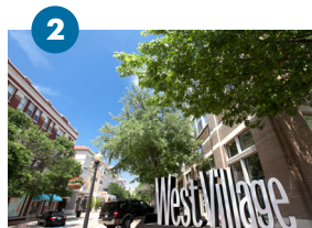
2 West Village Dallas

Centered around a park & ride DART Station. Houses an Angelika Theatre, restaurants, shopping, loft-style offices, and dwellings.