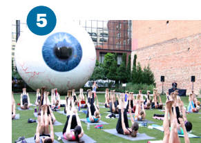
5 Main Street District Dallas

Built in the 1920s around Dallas' busiest trolley stop. Recent redevelopment maintains the vintage artsy character with 160 shops and restaurants.