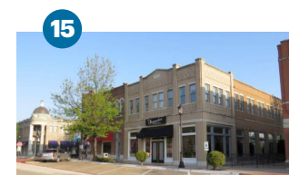
15 Parker Square Flower Mound

The city re-created a modern old-time town square with City Hall and a post office in the center of sidewalk shopping and eating.