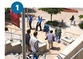
1 Mockingbird Station Dallas

Modern developments in every corner of the Dallas-Fort Worth region make the transition of a move to DFW easier than ever. These well-thought-out living centers make it possible to have an insta-community, where you literally walk from the place you live to shopping, dining, entertainment, green space, public transport, and sometimes even your workplace. Imagine how much time that frees up and how flexible your schedule becomes—not to mention the social opportunities it affords. In Dallas-Fort Worth, you're lucky enough to have many options for this new style of living. We highlight just a few notable locations. Many more are in the process of being built.