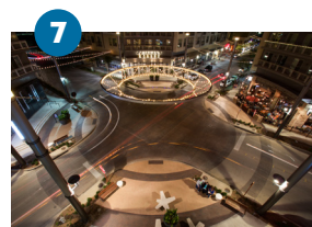
7 West 7th Fort Worth

Beginning with the conversion of a former Sears distribution center into lofts, the area has grown into a haven for artists, hip bars, and urban dwelling. Alamo Drafthouse, Gilley's, and Lorenzo Hotel are anchors.