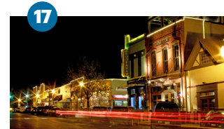
17 Downtown Plano Plano

Next to a DART line for a downtown commute and the Telecom Corridor. Services and a variety of dining options on-site could render you car-free.