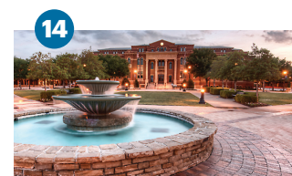
14 Southlake Town Square Southlake

National large retailers complement grocery stores, a Cinemark movie theater, casual restaurants, and residential complexes.