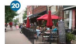
20 Downtown McKinney McKinney

This thousand-acre planned community sits around a 36-acre lake near Coppell. Includes one of the nation's first "net-zero" elementary schools.