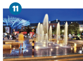
11 Addison Circle Addison

The Shops at Legacy is the vibrant heart of the Legacy Business Park. Legacy West is the newest addition to the area with 250+ acres of retail, dining, residential, hotel, and offices.