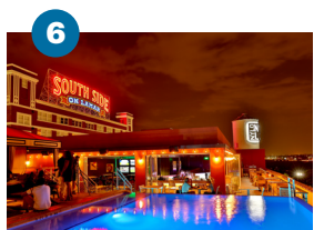
6 Cedars/Southside Dallas

Downtown Dallas' urban revival at its best. Preserved buildings let hotels pair with residences. Active nightlife and dining.