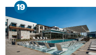
19 Cypress Waters Dallas

The town's established Oak Street and plaza has been redesigned, but maintains the historic downtown feel.