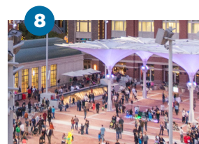
8 Sundance Square Fort Worth

The former headquarters of Acme Brick is now a pedestrian-friendly urban entertainment district not far from downtown, near TCU.