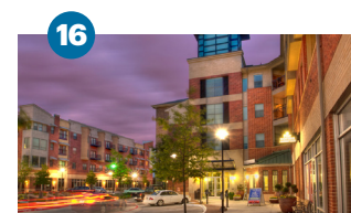
16 Eastside Richardson

Newly built but antique-looking storefronts surround a park with a gazebo. Also home to the campus of North Central Texas College.