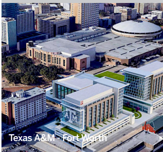
Texas A&M - Fort Worth

East Quarter and Deep Ellum are Downtown neighborhoods known for their dynamic blend of innovation, culture, and business. They both continue to involve and are key hubs for startups, creative industries, and tech-driven enterprises.