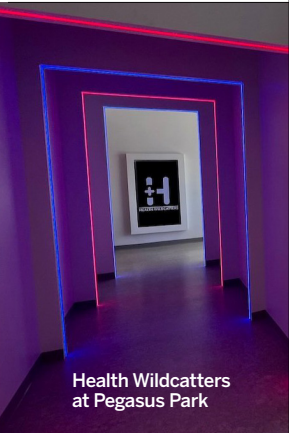
Health Wildcatters at Pegasus Park

Dallas Supporting human, social, and financial capital in early-stage entrepreneurs in the social innovation sector. The program is designed for entrepreneurs who have experienced systemic racial and gender inequities.