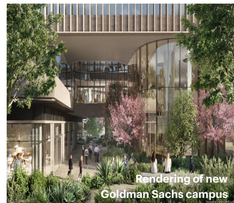
Rendering of new Goldman Sachs campus

Goldman Sachs will employ almost 5,000 people in a new three-building, 800,000-square-foot campus in Uptown Dallas. The company has been consolidating regional offices, bringing most of its employees to its existing Downtown Dallas office, where the technology and operations divisions are located. DFW is its second-largest workforce center behind New York. The new campus will open in 2027.