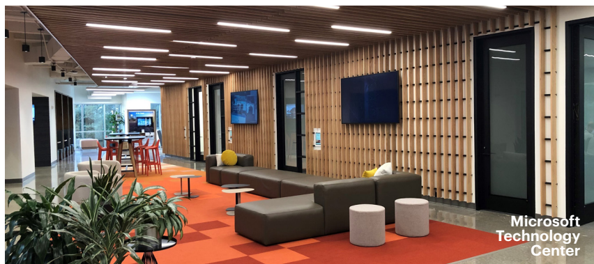
Microsoft Technology Center