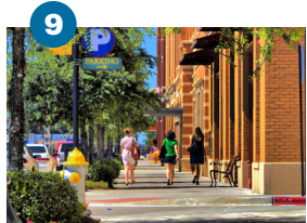
Frisco Square Frisco

Park free on the 35 blocks of brick-paved streets in Downtown Fort Worth. Features restored turn-of-the-century buildings and an expansive plaza.