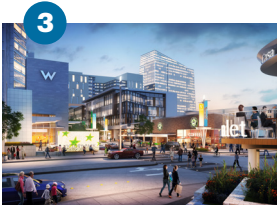
Victory Park Dallas

Pioneering walkable district in the heart of Uptown. Accessed by DART and the M-Line Trolley. Magnolia Theatre joins scene-packed dining and unique retail.