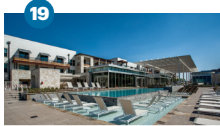
Cypress Waters Dallas

The town’s established Oak Street and plaza has been redesigned, but maintains the historic downtown feel.