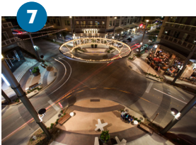
West 7th Fort Worth

Beginning with the conversion of a former Sears distribution center into lofts, the area has grown into a haven for artists, hip bars, and urban dwelling. Alamo Drafthouse, Gilley’s, and Lorenzo Hotel are anchors.