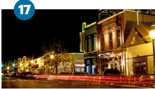
Downtown Plano Plano

Next to a DART line for a downtown commute and the Telecom Corridor. Services and a variety of dining options on-site could render you car-free.