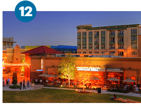
Watters Creek Allen

You’ll remember it for the giant blue steel sculpture in the center of a roundabout. You’ll visit for events like Kaboom Town and Oktoberfest.