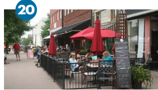
Downtown McKinney McKinney

This thousand-acre planned community sits around a 36-acre lake near Coppell. Includes one of the nation’s first “net-zero” elementary schools.