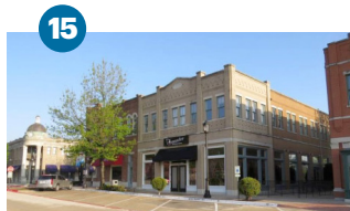
Parker Square Flower Mound

The city re-created a modern old-time town square with City Hall and a post office in the center of sidewalk shopping and eating.