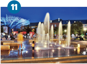
Addison Circle Addison

The Shops at Legacy is the vibrant heart of the Legacy Business Park. Legacy West is the newest addition to the area with 250+ acres of retail, dining, residential, hotel, and offices.