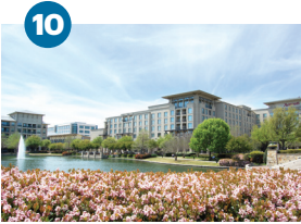
Legacy & Legacy West Plano

Incorporates Frisco’s City Hall and public library along with shopping, apartment buildings, and office space.