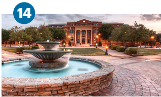
Southlake Town Square Southlake

National large retailers complement grocery stores, a Cinemark movie theater, casual restaurants, and residential complexes.