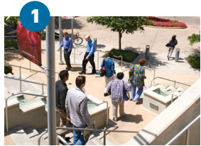
Mockingbird Station Dallas

Modern developments in every corner of the Dallas-Fort Worth region make the transition of a move to DFW easier than ever. These well-thought-out living centers make it possible to have an insta-community, where you literally walk from the place you live to shopping, dining, entertainment, green space, public transport, and sometimes even your workplace. Imagine how much time that frees up and how flexible your schedule becomes—not to mention the social opportunities it affords. In Dallas-Fort Worth, you’re lucky enough to have many options for this new style of living. We highlight just a few notable locations. Many more are in the process of being built.