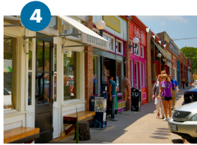
Bishop Arts Dallas

Anchored by the American Airlines Center with a crowd-gathering screen-filled plaza. High-rise living is upscale and service-oriented.