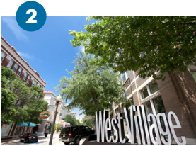
West Village Dallas

Centered around a park & ride DART Station. Houses an Angelika Theatre, restaurants, shopping, loft-style offices, and dwellings.