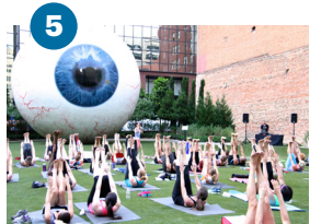
Main Street District Dallas

Built in the 1920s around Dallas’ busiest trolley stop. Recent redevelopment maintains the vintage artsy character with 160 shops and restaurants.