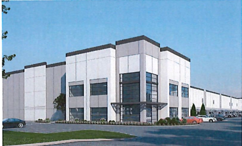
TRADE CENTER 20/35

Solar Turbines, Inc., who has been operating within the City of DeSoto since 1987 and is one of the largest employers in DeSoto with approximately 440 employees, expanded its facility with construction of a 24,000 square foot addition that accommodates additional testing, staging and final assembly of its industrial gas turbines for onshore and electrical power generation.