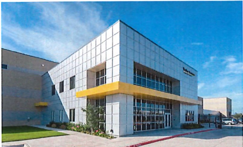
SOLAR TURBINES TESTING FACILITY

Solar Turbines, Inc., who has been operating within the City of DeSoto since 1987 and is one of the largest employers in DeSoto with approximately 440 employees, expanded its facility with construction of a 24,000 square foot addition that accommodates additional testing, staging and final assembly of its industrial gas turbines for onshore and electrical power generation.