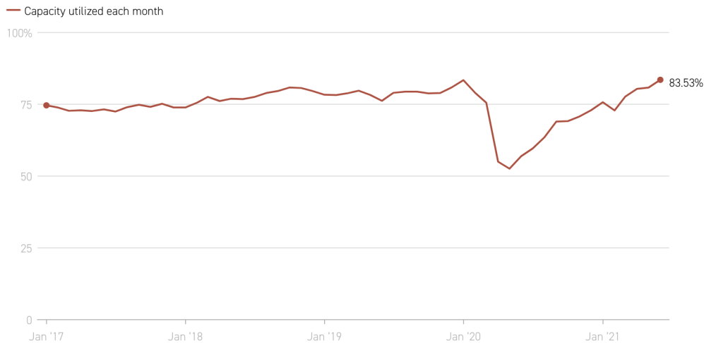
Chart: Steven Overly / POLITICO

Percent of total steel and iron production capacity used each month, Jan. 2017–June 2021