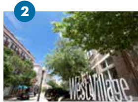
2 West Village Dallas

Centered around a park & ride DART Station. Houses an Angelika Theatre, restaurants, shopping, loft-style offices, and dwellings.