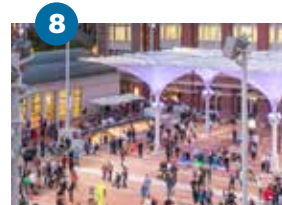
8 Sundance Square Fort Worth

The former headquarters of Acme Brick is now a pedestrian-friendly urban entertainment district not far from downtown, near TCU.