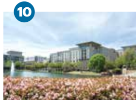
10 Legacy & Legacy West Plano

Incorporates Frisco's City Hall and public library along with shopping, apartment buildings, and office space.