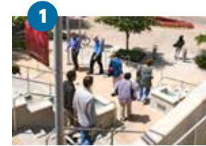
1 Mockingbird Station Dallas

Modern developments in every corner of the Dallas-Fort Worth region make the transition of a move to DFW easier than ever. These well-thought-out living centers make it possible to have an insta-community, where you literally walk from the place you live to shopping, dining, entertainment, green space, public transport, and sometimes even your workplace. Imagine how much time that frees up and how flexible your schedule becomes—not to mention the social opportunities it affords. In Dallas-Fort Worth, you're lucky enough to have many options for this new style of living. We highlight just a few notable locations. Many more are in the process of being built.