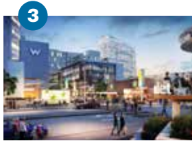
3 Victory Park Dallas

Pioneering walkable district in the heart of Uptown. Accessed by DART and the M-Line Trolley. Magnolia Theatre joins scene-packed dining and unique retail.