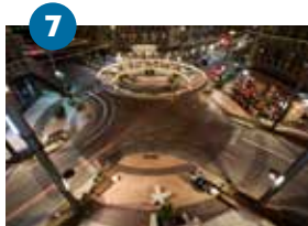
7 West 7th Fort Worth

Beginning with the conversion of a former Sears distribution center into lofts, the area has grown into a haven for artists, hip bars, and urban dwelling. Alamo Drafthouse, Gilley's, and Lorenzo Hotel are anchors.