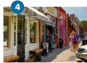
4 Bishop Arts Dallas

Anchored by the American Airlines Center with a crowd-gathering screen-filled plaza. High-rise living is upscale and service-oriented.