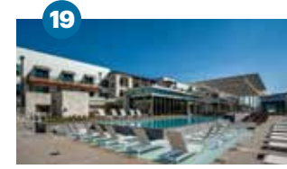
19 Cypress Waters Dallas

The town's established Oak Street and plaza has been redesigned, but maintains the historic downtown feel.