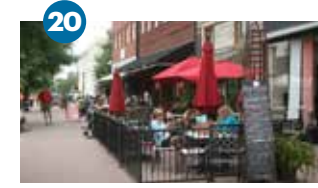
20 Downtown McKinney McKinney

This thousand-acre planned community sits around a 36-acre lake near Coppell. Includes one of the nation's first "net-zero" elementary schools.