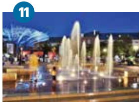
11 Addison Circle Addison

The Shops at Legacy is the vibrant heart of the Legacy Business Park. Legacy West is the newest addition to the area with 250+ acres of retail, dining, residential, hotel, and offices.