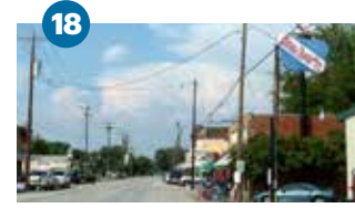
18 Downtown Roanoke Roanoke

Named as one of America's best downtowns, it includes a vibrant community of urban living, arts, unique shops, and restaurants.