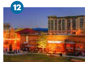
12 Watters Creek Allen

You'll remember it for the giant blue steel sculpture in the center of a roundabout. You'll visit for events like Kaboom Town and Oktoberfest.