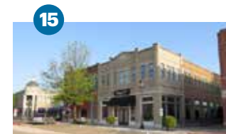
15 Parker Square Flower Mound

The city re-created a modern old-time town square with City Hall and a post office in the center of sidewalk shopping and eating.