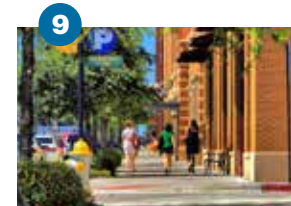
9 Frisco Square Frisco

Park free on the 35 blocks of brick-paved streets in Downtown Fort Worth. Features restored turn-of-the-century buildings and an expansive plaza.