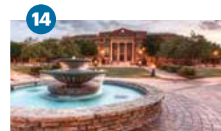
14 Southlake Town Square Southlake

National large retailers compliment grocery stores, a Cinemark movie theater, casual restaurants, and three residential complexes.