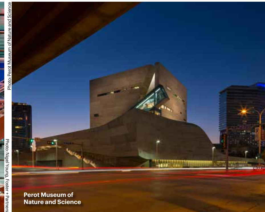
Perot Museum of Nature and Science