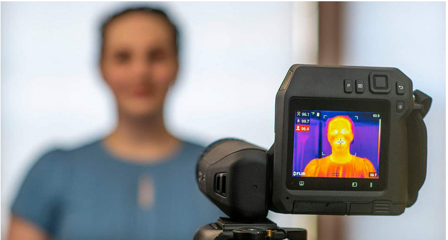
Thermal imaging cameras like these are used at Memorial Hermann Hospital in Houston to check temperatures. B&A has worked at MMHS since 2008.

Layer 4: In-Duct systems use UVc and Fresh Air to Kill Virus. Per the American Society of Heating, Refrigerating and Air-Conditioning Engineers (ASHRAE), there are four primary methods of reducing airborne infectious agents in the duct systems: 1. Dilution, 2. Filtration, 3. Pressurization and 4. Disinfection. .