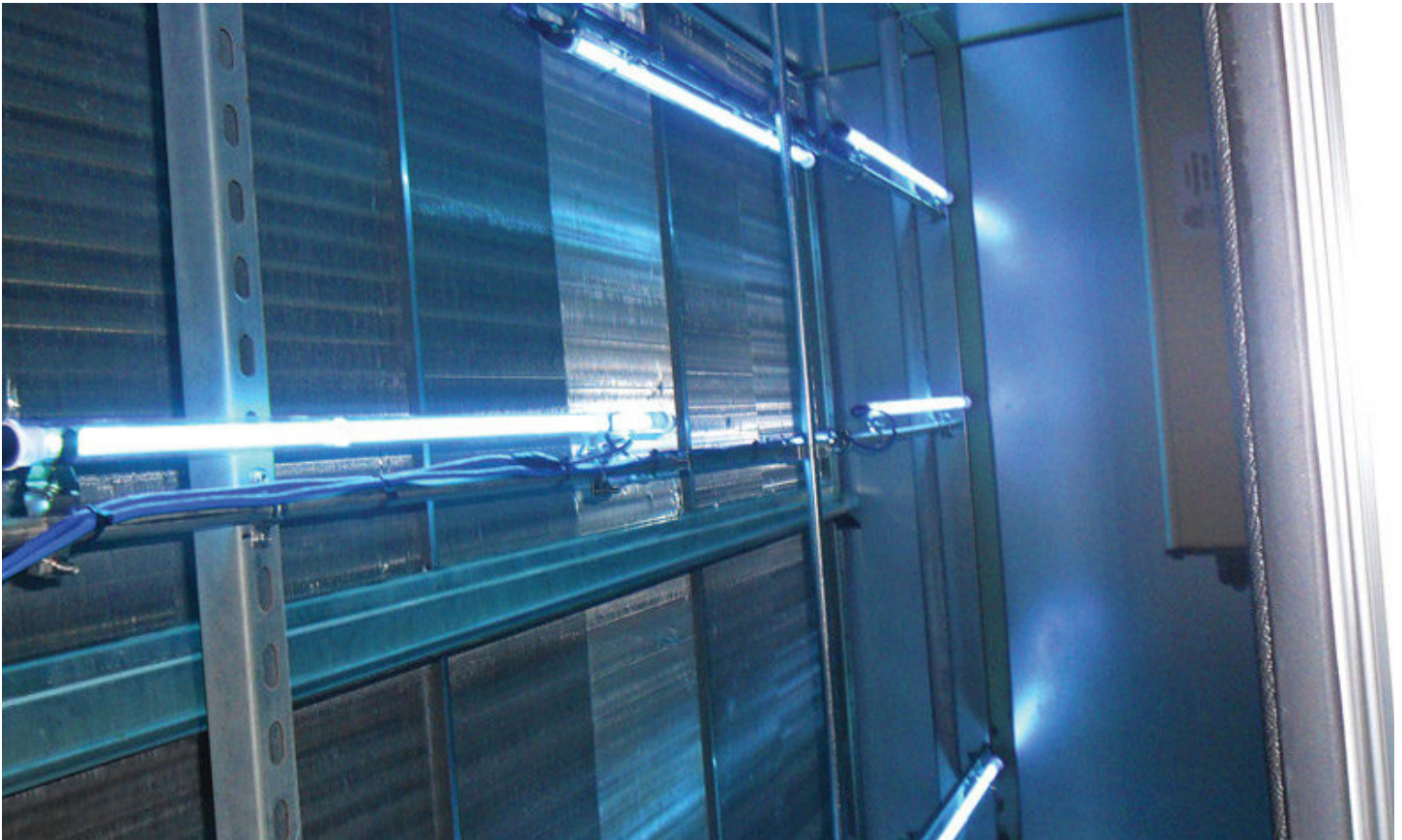
Coil Irradiation / Airstream Disinfection

In-Duct UVC systems, another method of air disinfection uses UVC lamps placed inside the ventilation system ducts. If a ceiling is too low for an upper-air irradiation fixture, an in-duct germicidal fixture can be used. Also, because people are not exposed to the UVC radiation, very high levels can be used inside the ducts.