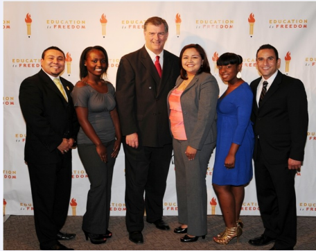
INTERN FELLOWS DURING THE 2011 LUNCHEON